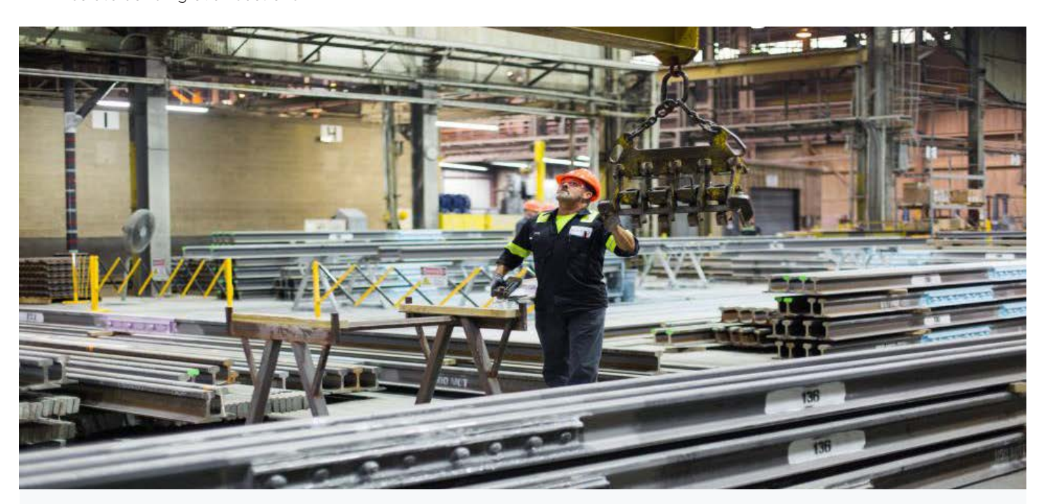
Railroad rail joints, Koppers, Inc., Huntington, West Virginia