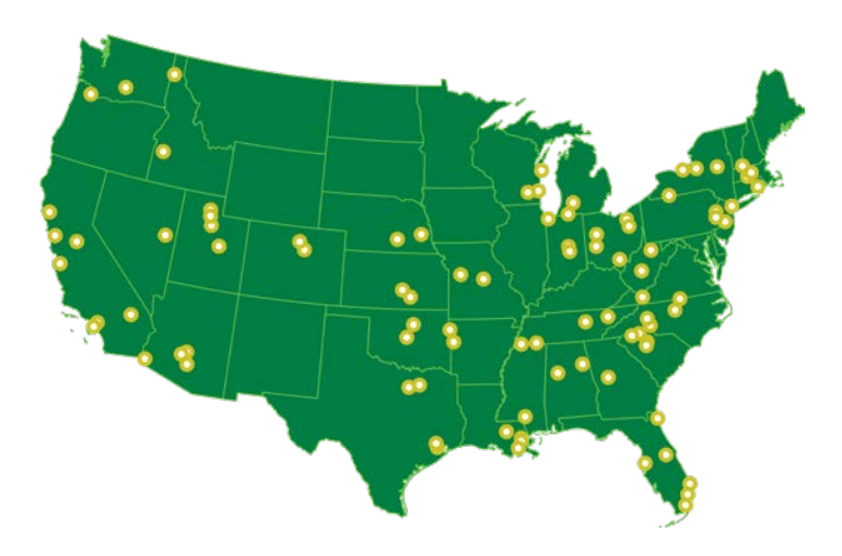
Figure 1. IAC Assessments Nationwide, October - December 2018

Plants assessed were located in 33 states (Figure 1). The assessed plants represent a broad range of industries, with fabricated metals and food being the most common (Table 2).